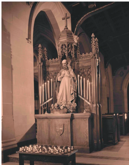
St. Jude Shrine, Lady Chapel – 1935

Since then, the Shrine has welcomed countless visitors who come seeking hope and strength through the intercession of Saint Jude. Each year, thousands take part in the annual pilgrimage, joining together from across the nation and beyond to honor the Apostle of Hope.